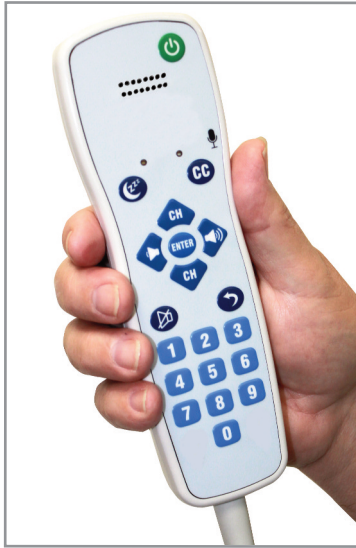
Series 8 with standard audio jack