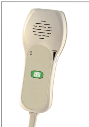
Series 7 optional audio jack