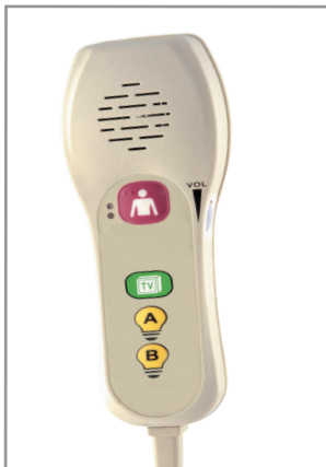
Series 7 optional audio jack