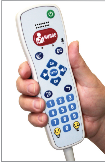
Series 8 with standard audio jack