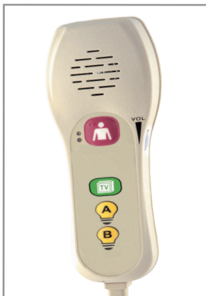
Series 7 optional audio jack