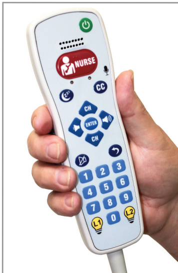
Series 8 with standard audio jack