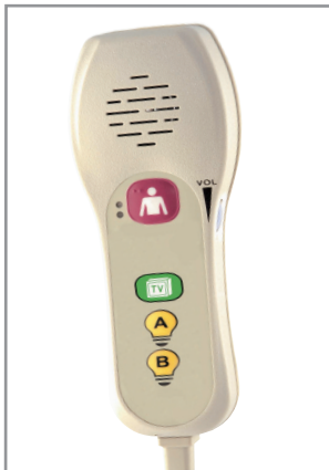
Series 7 optional audio jack